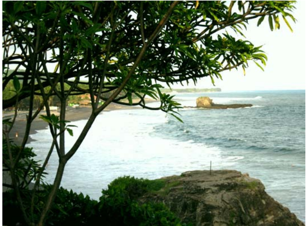
Playa "El Sunzal", El Salvador.